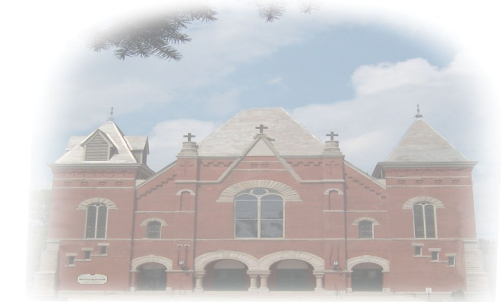
St. Francis de Sales Catholic Church 66 Granville St. Newark, OH 43055

St Francis de Sales Catholic Church St Vincent de Paul Society 345-9874 Please leave message at option 1